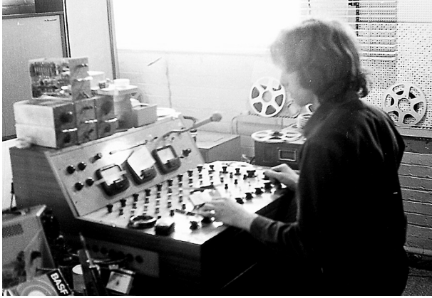
ABBEY ROAD STUDIOS