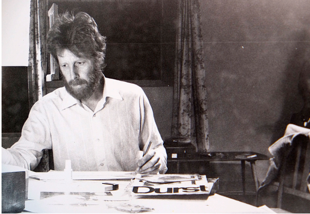
THE RAG PRESS